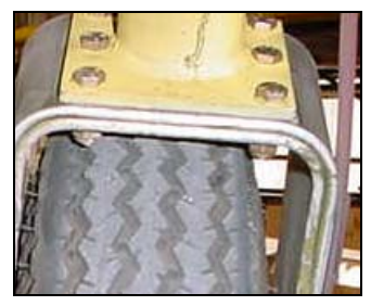
CH 601 HD and HDS, with wheel fork doubler 6L1-3HD.