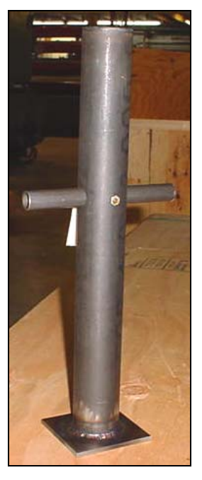
Replacement gear leg 6L1-1 priced at $58.00 each + shipping/handling, available from Zenith Aircraft Co.