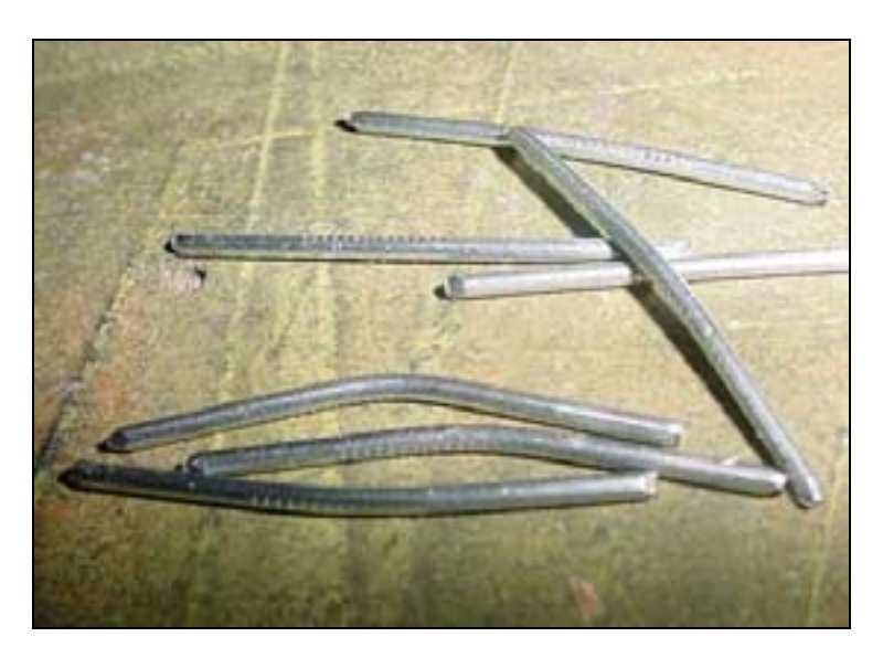
NOTE: The stem will bend on both the aluminum and stainless steel pin.

To center punch the pin: Position the stem on the pin, hammer down on the stem. Repeat the test several times, use a new stem each time.