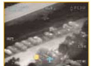
Sharp IR Imagery