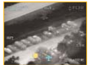
Sharp IR Imagery