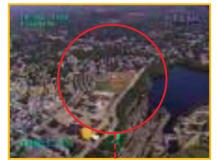
TV Camera WFOV

FLIR is the world's leading supplier of advanced infrared imaging systems for military, government and law enforcement applications. FLIR's global network of service and support centers assures customers the experience, resources, commitment they demand.