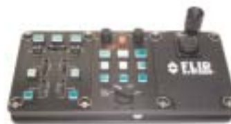
Laptop Control Unit