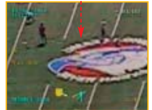
TV Camera NFOV